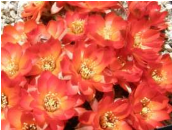
Mediolobivia steinmannii, a body obscured by flowers.

Apr 10-15: The Cactus & Succulent Society of America's convention, Tucson, AZ.