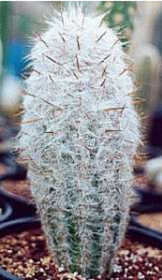
Fig. 2. Oreocereus trollii