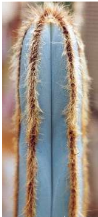
Fig. 3. Pilosocereus fulvinatus

Systematics aside, there are a diversity of species, with a wide range of color, form, spination and size for collectors and growers in the San Diego area. The most diverse groups, with many species available from local growers and nurseries include Oreocereus , Cleistocactus , Cereus , Pachycereus , Pilosocereus , Stenocereus , Espostoa , Browningia (= Azureocereus ) and Haageocereus . Some, such as the south American Espostoa and Oreocereus (Fig. 2), are noted for their dense white wool; others, such as Browningia and Pilosocereus (Fig. 3) for inclusion of species with beautiful glaucous blue coloration. Species of Haageocereus and Micranthocereus (Fig. 4) contain members with attractive golden spination.