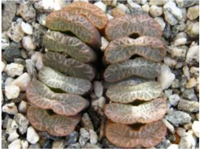
Haworthia truncata 'sakai 162'

As the lazy days of summer loft on by I'm impressed at my plant's abilities to withstand and even flourish in spite of my almost complete neglect; the summer solstice seems to always turn an abrupt corner for some of the unnatural flora occupying my little corner of the world. A few things gave up the ghost while I was off with the family on vacation, but probably as much due to my fevered "I've got