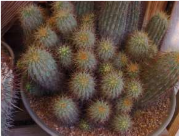
Copiapoa cinerea haseltonia var. elongata Grigsby 1961