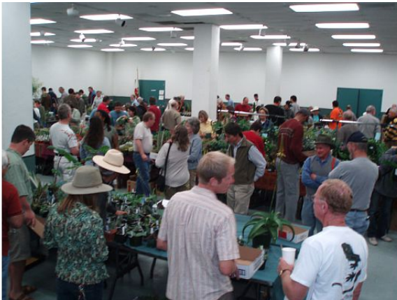
The morning rush, 2008 Winter Show & Sale.