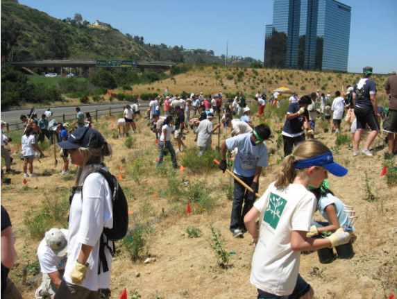
River Garden volunteers hard at work.