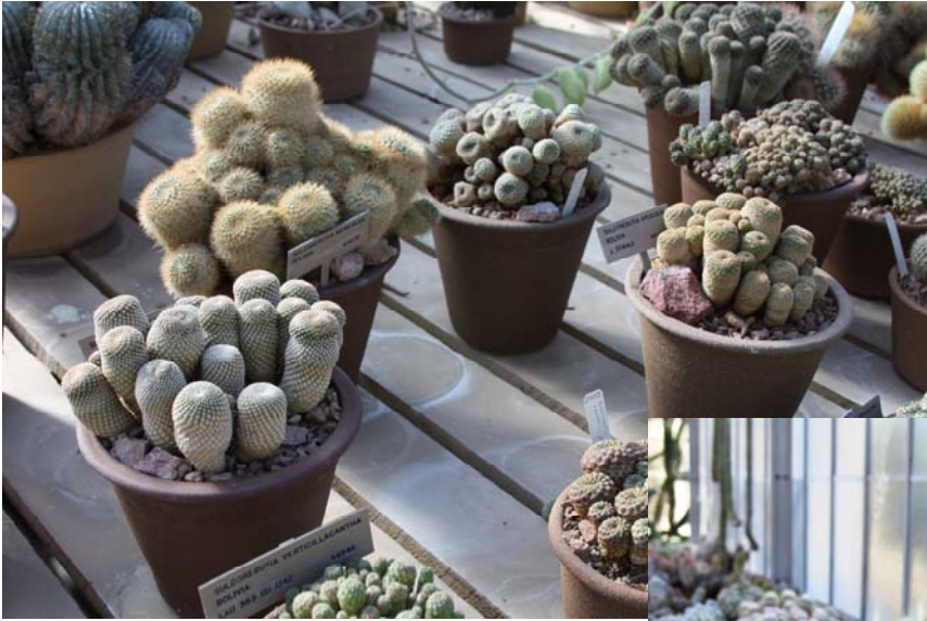
Above - A sampling from the greenhouse Sulcorebutia collection.