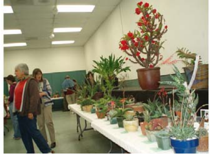
Show plants 2008

The Winter Show is upon us, time to look through your collection to find that happy plant or two, your favorite or those that you are proud of. Many plants look their best this time of year such as pelargoniums, othonnas, others that are dormant have a different look such as color change perhaps, that make them interesting this time of the year. This show has been getting larger and more exciting every year, to keep this happening I need you to bring in your special plants. As the show grows some small changes need to be made, the show will still be by family, the cactacea will be divided into North and South American species. The show will be judged, the three judges will be selected from those attending ($25 plant credit each), judging will commence at the beginning of show. I will act as tie breaker. Award categories are the last area of change this year. I have given this some serious thought since I was volunteered for the job last week, so here it is: