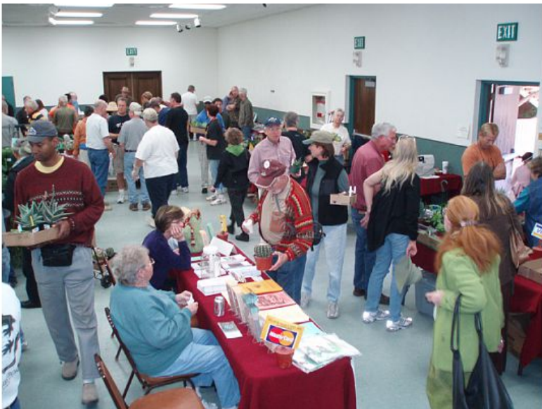
Reception area, 2008 Show & Sale

If you have any questions please contact any member of the board. If you are interested in working with one of these groups or have suggestions please contact the Strategy Owner. We cannot achieve our Vision without the help and support of everyone in the organization.