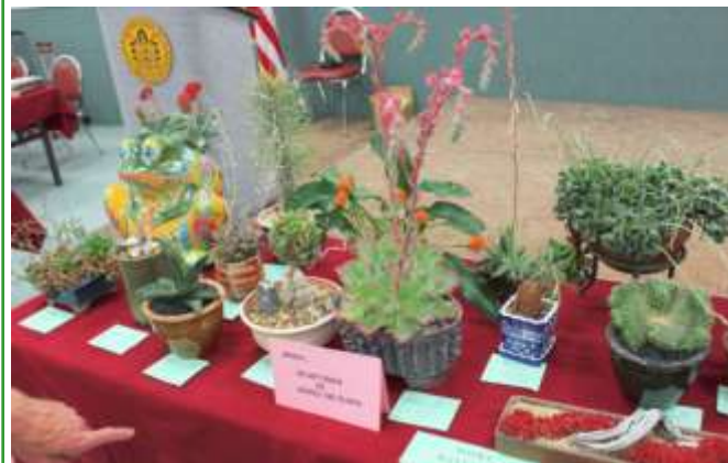
Left: The Novice Succulent Brag Table entries.