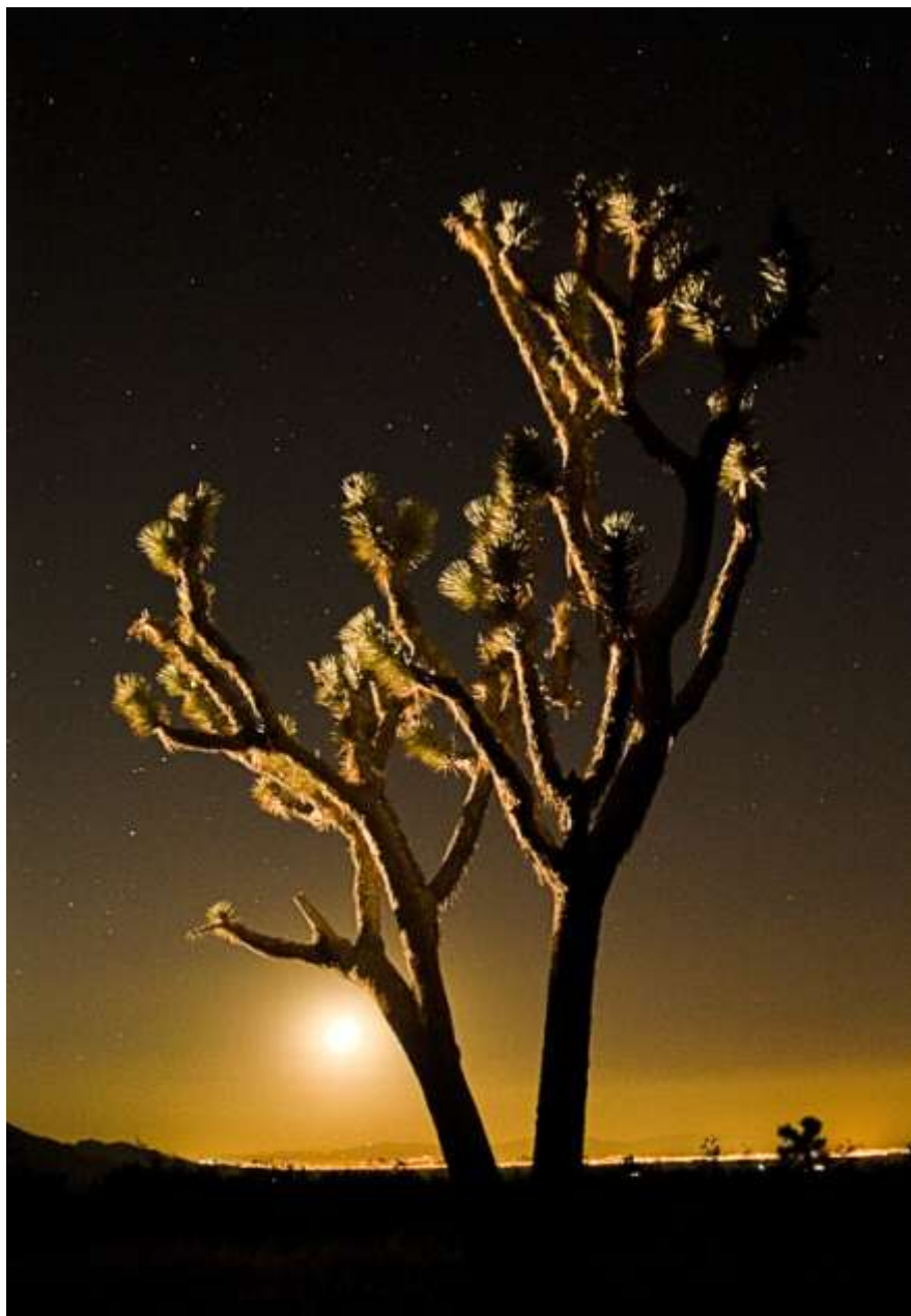
“Joshua Tree with Moon” by Rene Caro