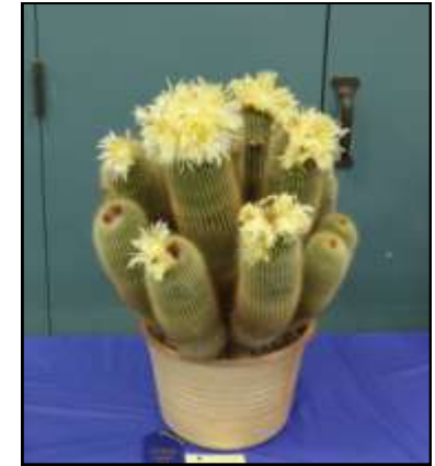
Notocactus leninghausii , Dan Patterson