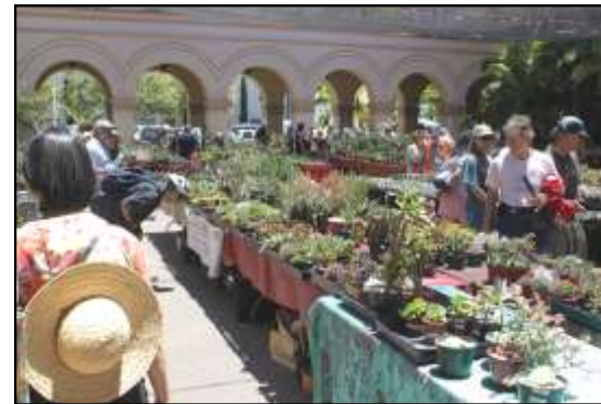
Sales area activity