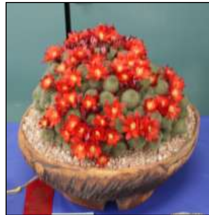
Rebutia sanguinea