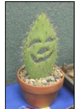
Opuntia littoralis