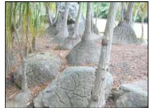
Rock or Beaucarnea ?