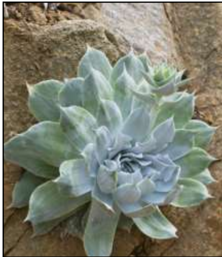
Dudleya pulverulenta with bloom