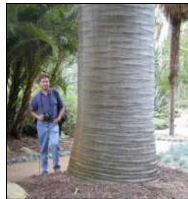
Jubaea chilensis and Cactus walk