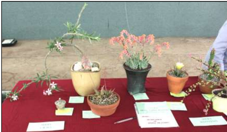
Novice entries on the July Brag Table