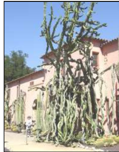
Top two photos from 2004 SDCSS trip, The rest from a trip by the editors in 2002 with the SGVCSS