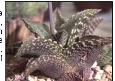
Dick Hulett's Haworthia venosa ssp. Tessellata

Haworthia venosa ssp. tessellata has a large number of leaf forms in cultivation, some with delicate patterns formed in nearly flat tops, some deeply incurved as shown in the picture on the previous page. An interesting collection can be made of this species alone.