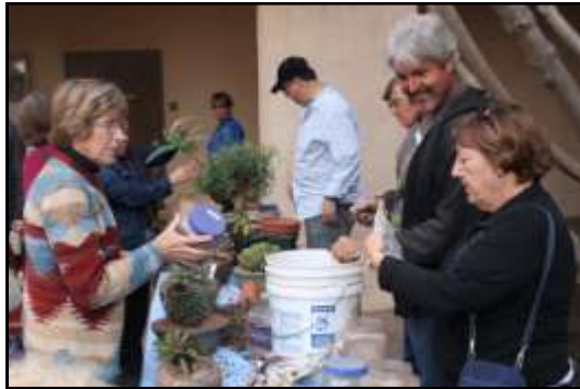
After the Workshop