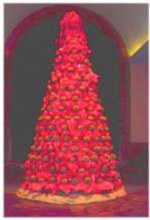
The 2011 Xmas tree at the La Paloma Hotel in Tucson. Site of the 2009 CSSA Convention.