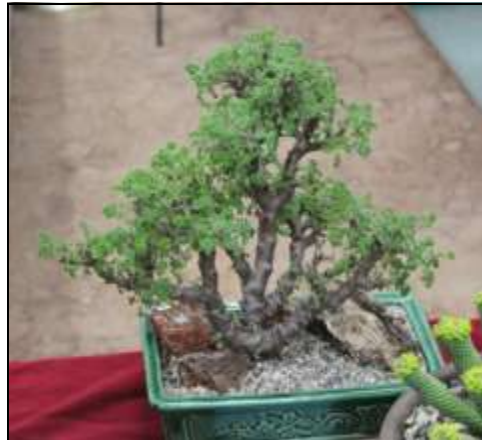
Rudy Lime's Pelargonium alternans