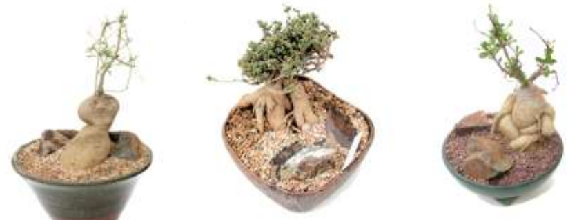
Above: Some of the more interesting auctioned plants. See page 7 for more auction action.

The auction was a great success, bringing in almost $1,000 for the trophy fund. I want to thank everyone involved, donors, volunteers and bidders. Next year the auction will go back to the old format and will benefit the Anza Borrego Foundation.