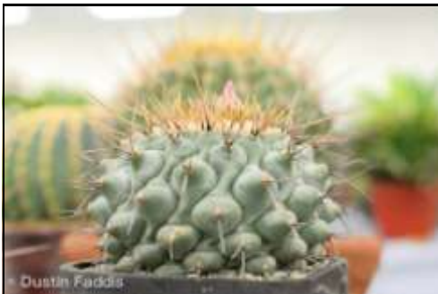
Left, top to bottom: Show room waiting to open; Scurrying buyers; Blooming Euphorbia ; Carved Thelocactus . Right, top to bottom: Paying customers still buying; Patterned caudex.