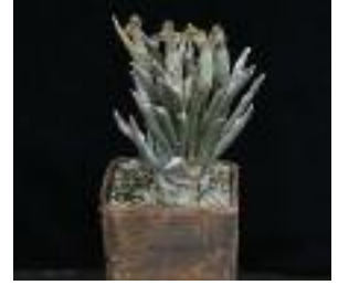
Best Graft: Juergen Menzel's Digitostigma caput-medusae