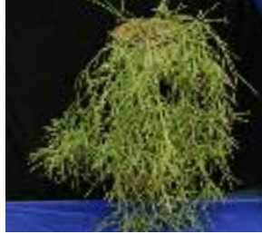
Best Epiphytic Cactus: Terry & Col- lette Parr's Rhipsalis pachyptera