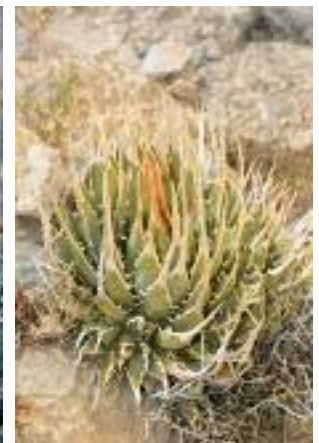
Agave utahensis eborespina