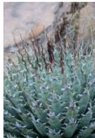
Agave utahensis nevadensis

I often look for the odd characters instead of the norm when I am out in the field. This, by the way, is not the best for typifying and getting a clear understanding about a particular species, but it is none the less a wonderful diversion. I often will try to gather pollen or seed from unusual and interesting forms for use in current or future hybridizing projects, and it is in fact how I have come up with some special, strange and beautiful plants.