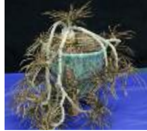
Best Euphorbia: Don Hunt's Euphorbia waringiae