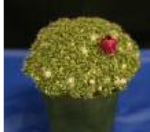
Best Opuntia: Jurgen Menzel's Tephrocactus incahuasi