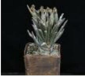
Best Cactus: Juergen Menzel's Digitostigma caput-medusae