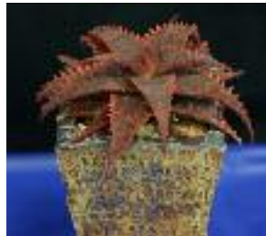
Best Aloe in Show: Kelly Griffin's Aloe 'Christmas Sleigh'