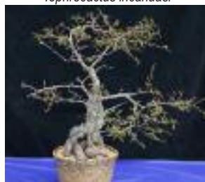
Best Plant Grown from Seed by Exhibitor: Kelly Griffin's Operculicarya decaryi