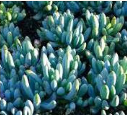
FIGURE 1 SENECIO SERPENS

Senecio can make an excellent ground cover. The fast spreading and low lying S. mandraliscae is commonly seen along our freeway embankments. The smaller and more bluish S. serpens (Figure 1) is slower growing and makes a fine ground cover in succulent gardens without running rampant.