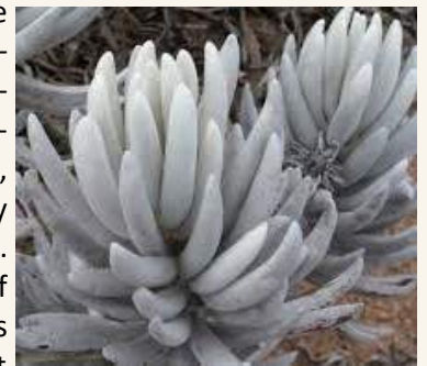
FIGURE 4 SENECIO HAWORTHII

Many enthusiasts (see Rowley, 1994) consider S. haworthii (Figure 4) to be the finest of the succulent Senecios . The leaves are enveloped in a dense skin-like cover of cottony wool, giving the plant a nearly pure white appearance. This is a popular species of limited supply that sells out quickly at Succulent Society shows.