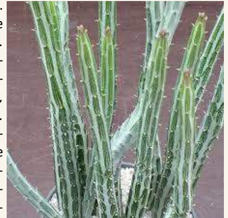
FIGURE 3 SENECIO STAPELIIFORMIS

tolerant of full sun. Common ones include S. medley-woodii , S. decaryi , S. cephalophorus , S. barber-tonicus , S. cylindricus , S. ficoides and S. crassissimus . S. barber-tonicus can be seen along the sidewalk of the road leading into the zoo entrance. These species are commonly viewed