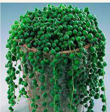
FIGURE 2 SENECIO ROWLEYANUS

Senecio stem succulents include the low growing and smaller species, S. stapeliiformis ('Peppermint Stick'; Figure 3) and S. pendula , with its contorted growth form, as well as the erect and larger succulent-stemmed landscape plant S. anteuphorbium ('Swizzle Stick'), native to Morocco.