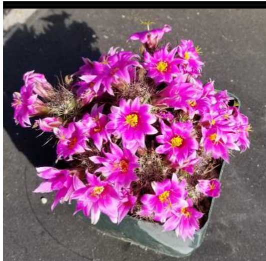
On the Cover: Baja Garden at the Safari Park. Photo by Susan LaFreniere. Use with permission of the San Diego Zoo, Safari Park.