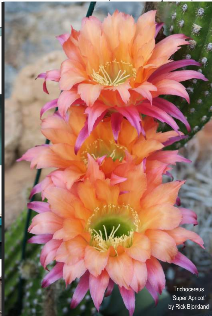
Trichocereus 'Super Apricot' by Rick Bjorkland