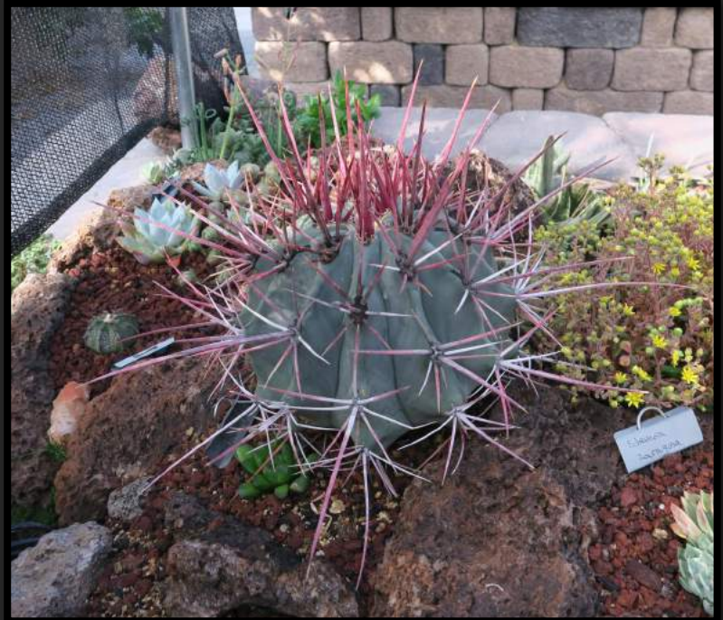
Grown and photographed by Rick Bjorkland