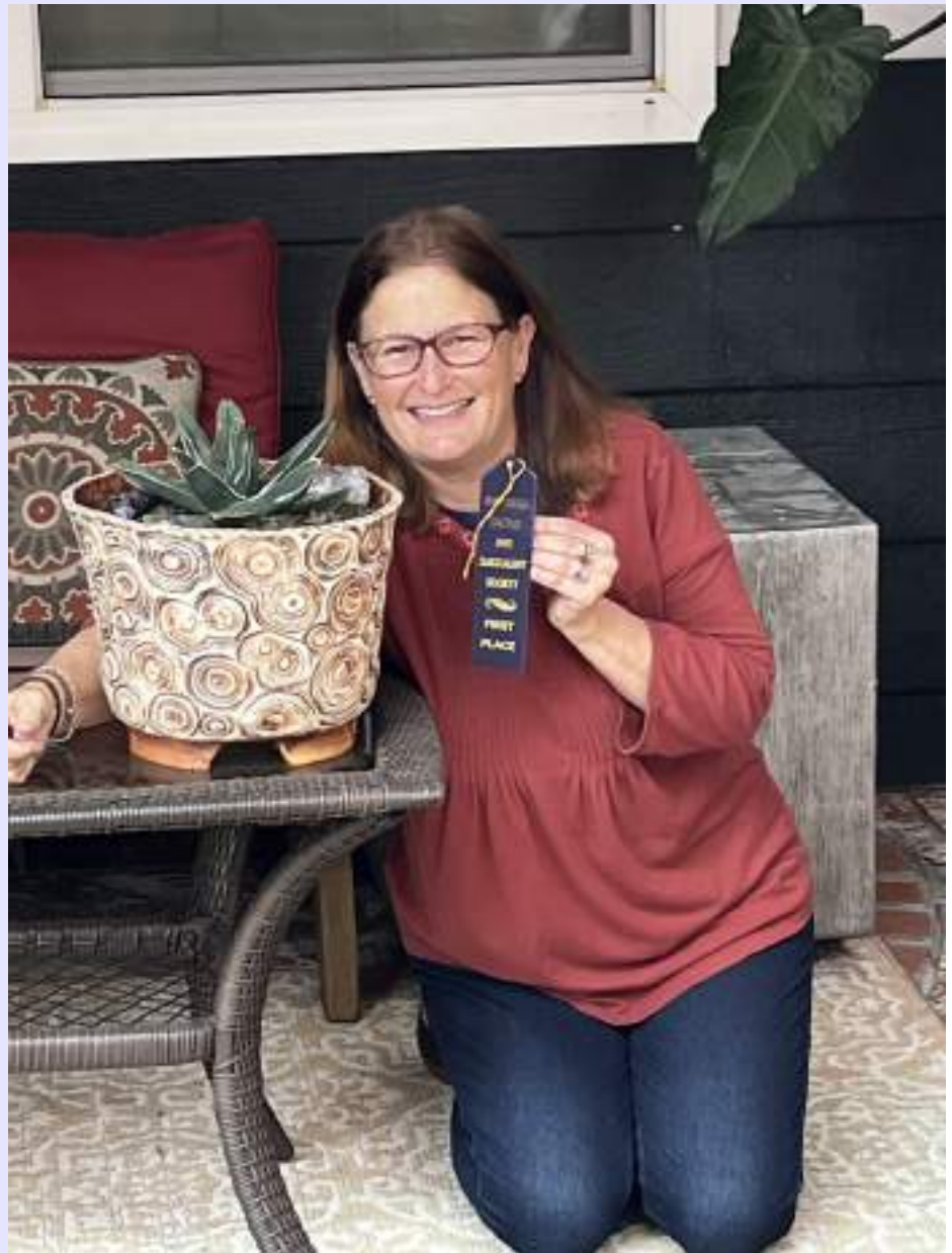
The agave in Muradian pot, and its proud owner

"I changed the name of your plant." A gentleman says to me.