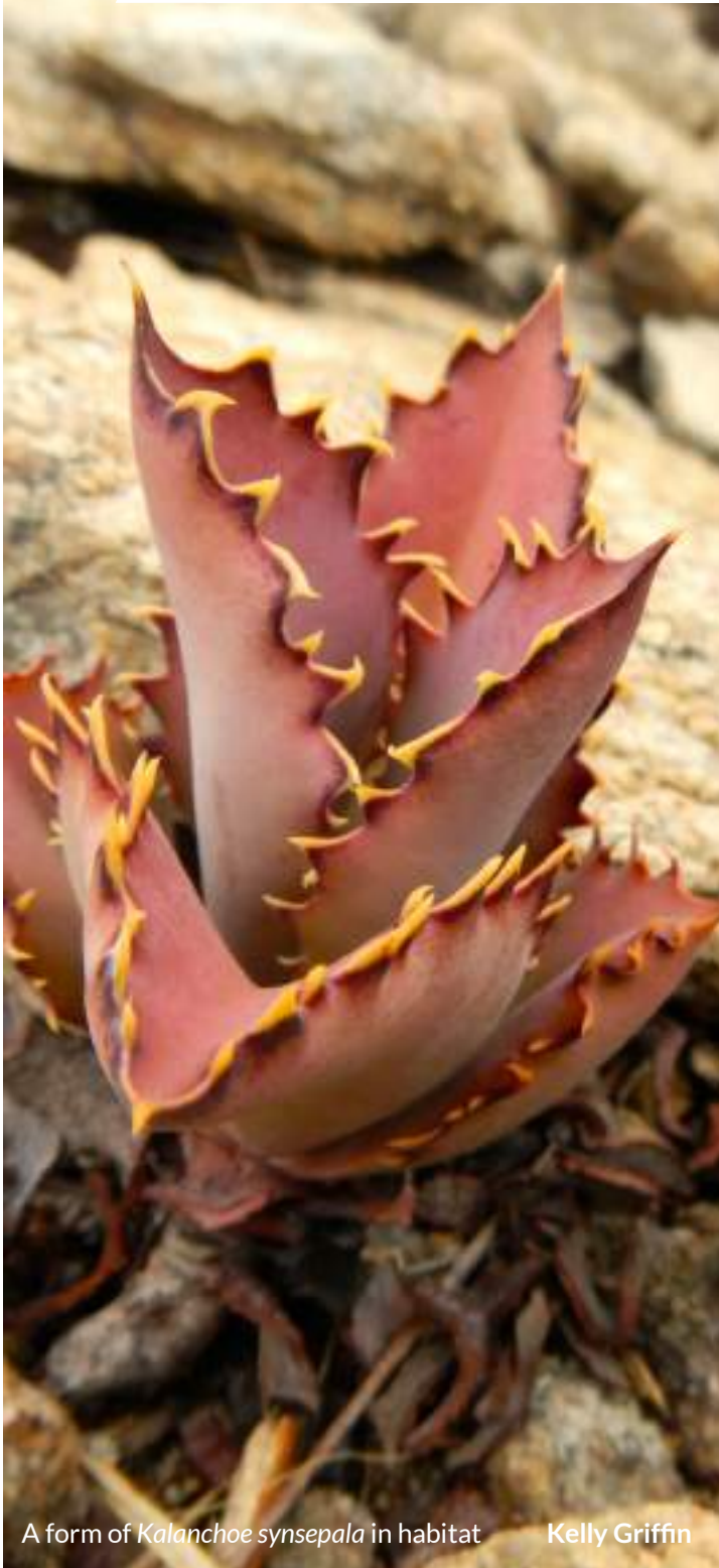
A form of Kalanchoe synsepala in habitat

Kalanchoe is a diverse genus of tropical, perennial succulents native to Africa, Arabia, and Asia. It is a member of the stonecrop family (Crassulaceae) and has 175 accepted species . The Kalanchoe genus includes everything from small trees, shrubs, and monocarpic plants a few inches tall, to even climbers. One of the things that sets Kalanchoes apart from other members of the Crassulaceae is having 4 petals instead of 5 on the flower. It is prized for its long-lasting, colorful, showy flowers and interesting, succulent foliage. In some species, such as K. thyrsiflora , the inflorescences are densely flowered and club shaped, while in others, such as K. sexangularis , the inflorescences are more diffuse but apically carry numerous, small, tubular flowers with recurved corolla lobes.