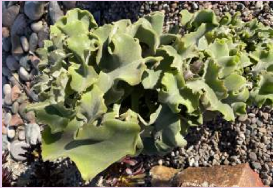
Kalanchoe beharensis , with tomentose leaves, in the garden

Some leaves of kalanchoe are hairy, or tomentose, while others have purple-mottled leaves such as K. marmorata . The foliage is unique and will add color and texture to your landscape or houseplant collection. These plants are food plants for caterpillars of the Red Pierrot butterfly in India and southeast Asia. The butterfly lays its eggs on leaves, and after hatching, caterpillars burrow into the leaves and eat their inside cells.